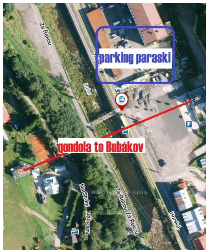
Parking Vrchlabí / Parking Bubákov